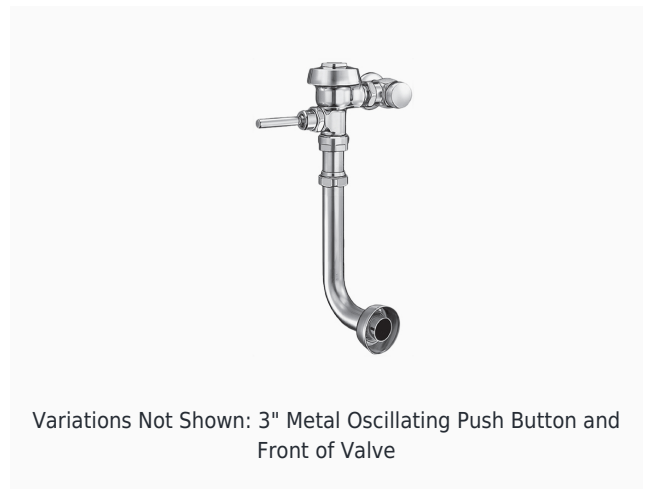
Variations Not Shown: 3" Metal Oscillating Push Button and Front of Valve